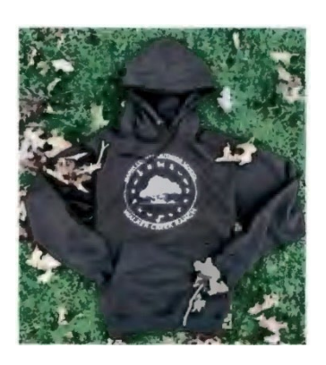
B. Hooded Sweatshirt Color: Brown $38.00 (S-XL) $42.00 (XXL)